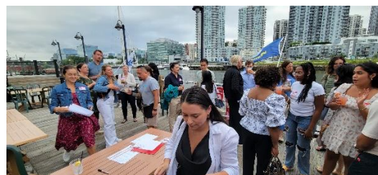
On a beautiful August evening, over 45 recent Ivy alums gathered at the Crab Shell overlooking Stamford Harbor.